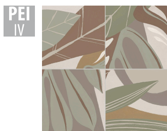
HBA002 33,15x33,15 cm Thickness 7.5 Package contains 1.32 m 2 , 12