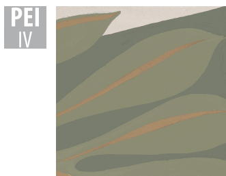
HBA005 16,5x16,5 cm Thickness 7.5 Package contains 0.55 m 2 , 20