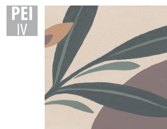
HBA004 16,5x16,5 cm Thickness 7.5 Package contains 0.55 m 2 , 20