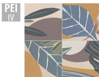
HBA001 33,15x33,15 cm Thickness 7.5 Package contains 1.32 m 2 , 12