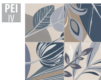
HBA003 33,15x33,15 cm Thickness 7.5 Package contains 1.32 m 2 , 12