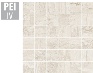
PTN010 30x30 cm Thickness 9 Package contains 1 m 2