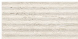
PTN004 32x62,5 cm Thickness 9 Package contains 1 m 2 , 5