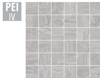
PTN012 30x30 cm Thickness 9 Package contains 1 m 2