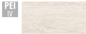
PTN007 59,1x119,1 cm Thickness 11 Package contains 1.41 m 2 , 2