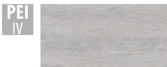
PTN009 59,1x119,1 cm Thickness 11 Package contains 1.41 m 2 , 2