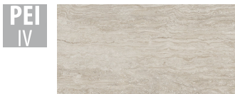
PTN002 32x62,5 cm Thickness 9 Package contains 1 m 2 , 5