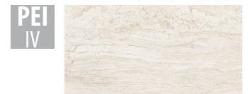
PTN001 32x62,5 cm Thickness 9 Package contains 1 m 2 , 5