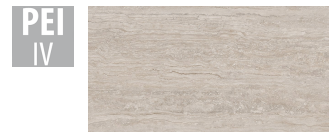
PTN008 59,1x119,1 cm Thickness 11 Package contains 1.41 m 2 , 2