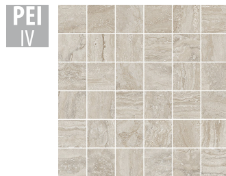
PTN011 30x30 cm Thickness 9 Package contains 1 m 2