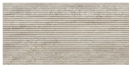
PTN005 32x62,5 cm Thickness 9 Package contains 1 m 2 , 5