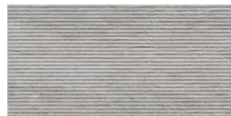
PTN006 32x62,5 cm Thickness 9 Package contains 1 m 2 , 5