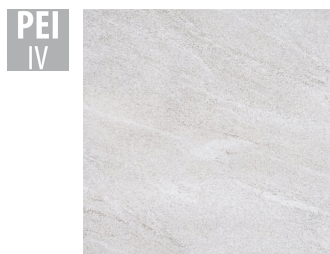
TIK005 61,5x61,5 cm Thickness 8.5 Package contains 1.54 m², 4