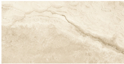
RIT008 30x60 cm Thickness 8.5 Package contains 1.44 m 2 , 8