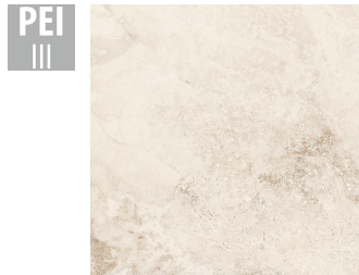
RIT005 45x45 cm Thickness 9 Package contains 1.42 m 2 , 7