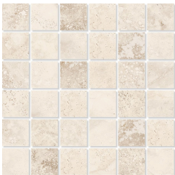
RIT004 33x33 cm Thickness 9 Package contains 1 m 2